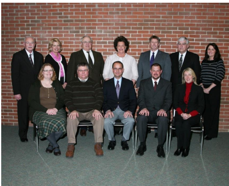
2013 Board of Directors

A twelve member Board of Directors govern the Rush County Community Foundation. The Board of Directors determines the Foundation's policies and provides oversight to its operation.