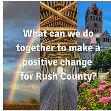
Thank You For Your Input!