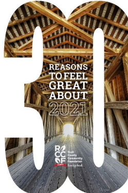
Read Your Annual Impact Report