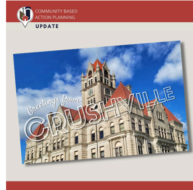
CBAP Update: Greetings from Crushville