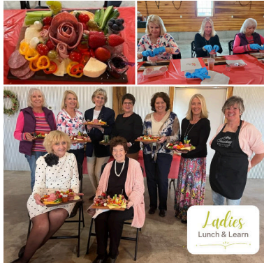
Reunited: Ladies & Lunch Event

Here are the top stories from last month.