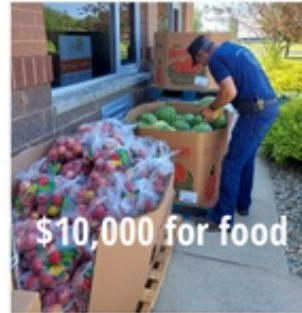
Milroy Community Food Pantry