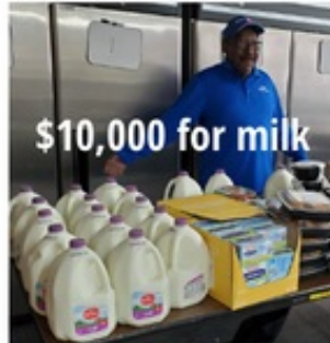
Rush County Community Assistance Food Pantry