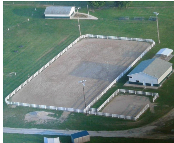
RUSH COUNTY 4-H HORSE &