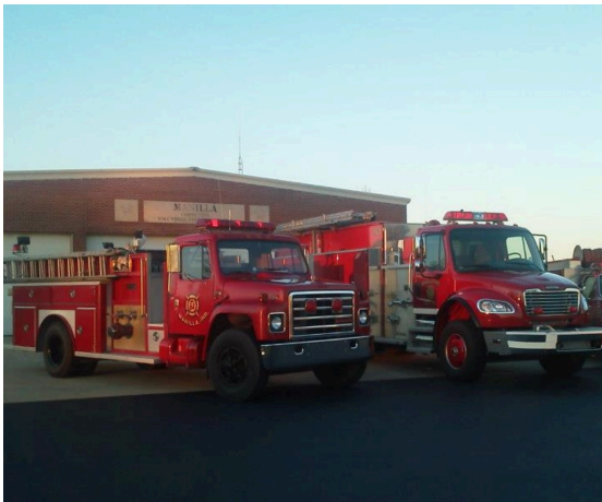
MANILLA VOLUNTEER FIRE

Your gifts to Community Grants Funds are working hard to keep Rush County safe today and for years to come.