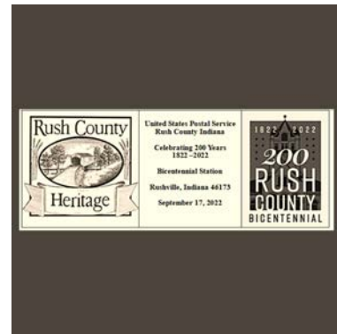
Get a Bicentennial Postal Cancellation