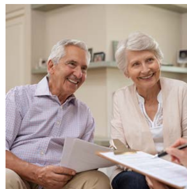
QCDs: Tax Benefits