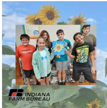
Grantee Update: Rush County Farm Bureau