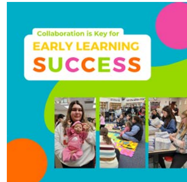
Grantee Update: RCHS FACS + First5