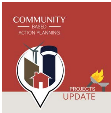
CBAP Projects Update: Passing the Torch