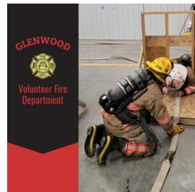
Grantee Update: Glenwood Vol Fire Dept