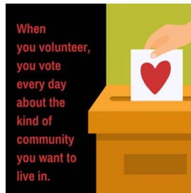
We ♥ Our Volunteers!