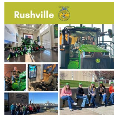
Grantee Update: Rushville FFA