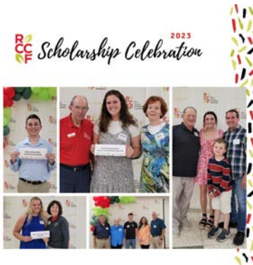
Scholarship Celebration Recap

Here are the top stories from last month.