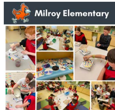
Grantee Update: Milroy Elementary