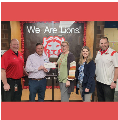
Legacy Gift to Benefit RES

Here are the top stories from last month.