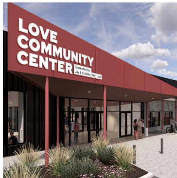
3 grants to support the LCC