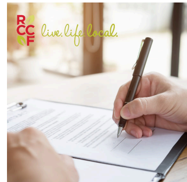
7 new funds started (as of 12/13)